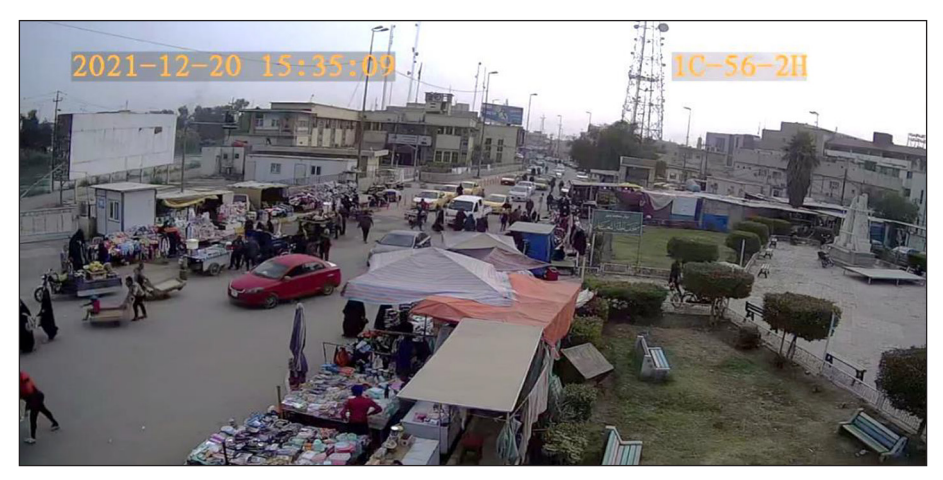
Figure 2. Muhrmat Shat Al- Hilla Street, study area